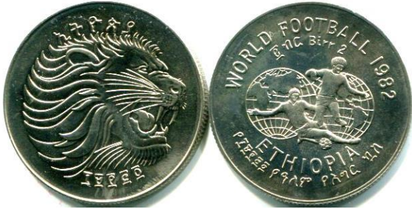
Item ET-2BIRR ETHIOPIA 2 BIRR 1982 WORLD CUP SOCCER KM64 UNC. .... $9.75

The obverse of this Ethiopian 1982 2 Birr coin features the fierce head of the Ethiopian Lion. The obverse legends are in Ethiopian. The reverse commemorates the 1982 World Cup Soccer championship. The design includes two soccer players, globes showing both hemispheres of the earth and legends in both English and Ethiopian. The 38.75mm coin is struck in copper-nickel.