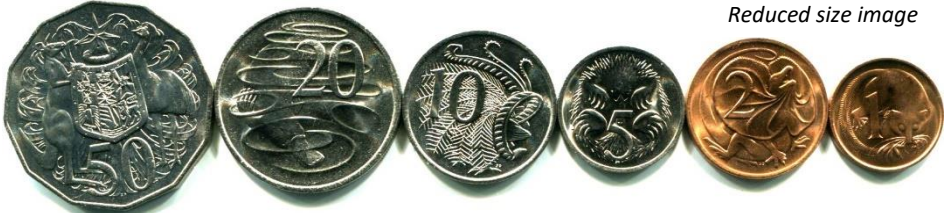
Reduced size image

Item S-VN-SET5 VIETNAM 5 COIN SET 200 - 5000 DONG, 2003 KM71-75, UNC. $12.00