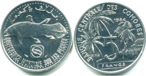
Item KM-5F COMOROS 5 FRANCS 1984 KM15 BU.....$5.00

The Coelacanth is known as a “living fossil”. The primitive fish was believed to be long extinct until a scientist found one in a fisherman’s net. It turned out the folks on the Comoros islands had been eating them for years. A Coelacanth is featured on this 31mm aluminum 5 Francs dated 1984. It was issued by Comoros in conjunction with the World Fisheries Conference. The other side features coconut palms and coconuts. Comoros is a republic located on a group of small islands off the east coast of Africa.