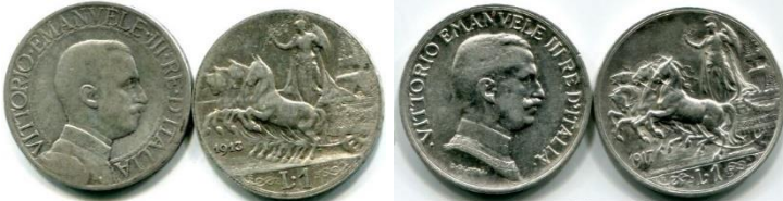
Slow Quadriga 1908-13