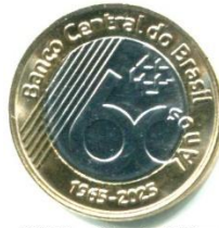
2025 - Central Bank

Central Banks seem to like to commemorate themselves, even when they do a really poor job of managing their currency and most citizens really don't care for central banks. Brazil recently two circulating commemorative 27mm bi-metallic 1 Real