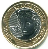
2024 - Real